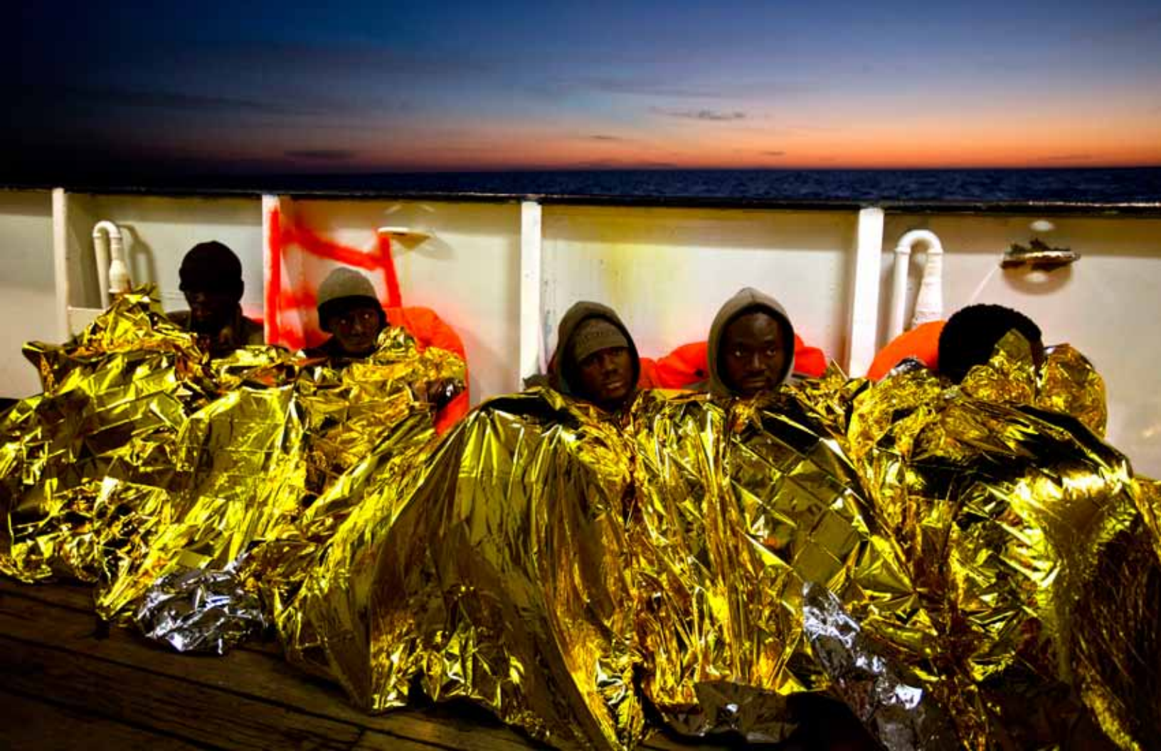
Rescued migrants shelter on the deck of the Golfo Azzurro in January, 2017.

for over ... months now and you are conducting activities that cause problem to Libyan state sovereignty. Therefore I ask you to alter your course toward Tripoli port. If you do not obey the orders right now you will be targeted.”